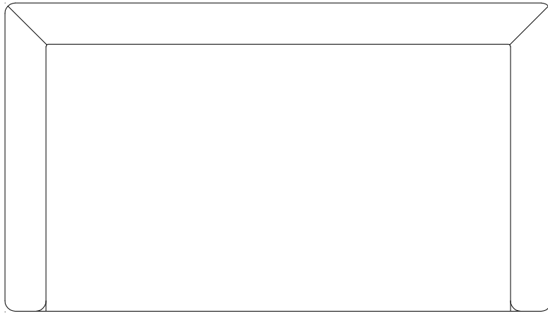
Plan View scale 1 : 16 mm