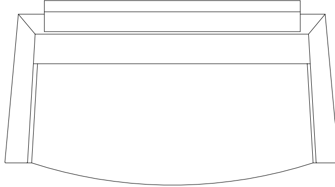
Plan View scale 1 : 10 mm