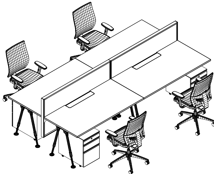
3D Isometric not to scale