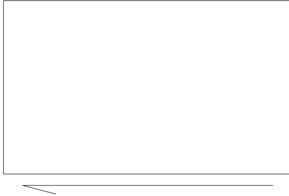
Plan View scale 1 : 40 mm