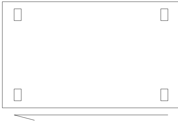
Plan View scale 1 : 10 mm