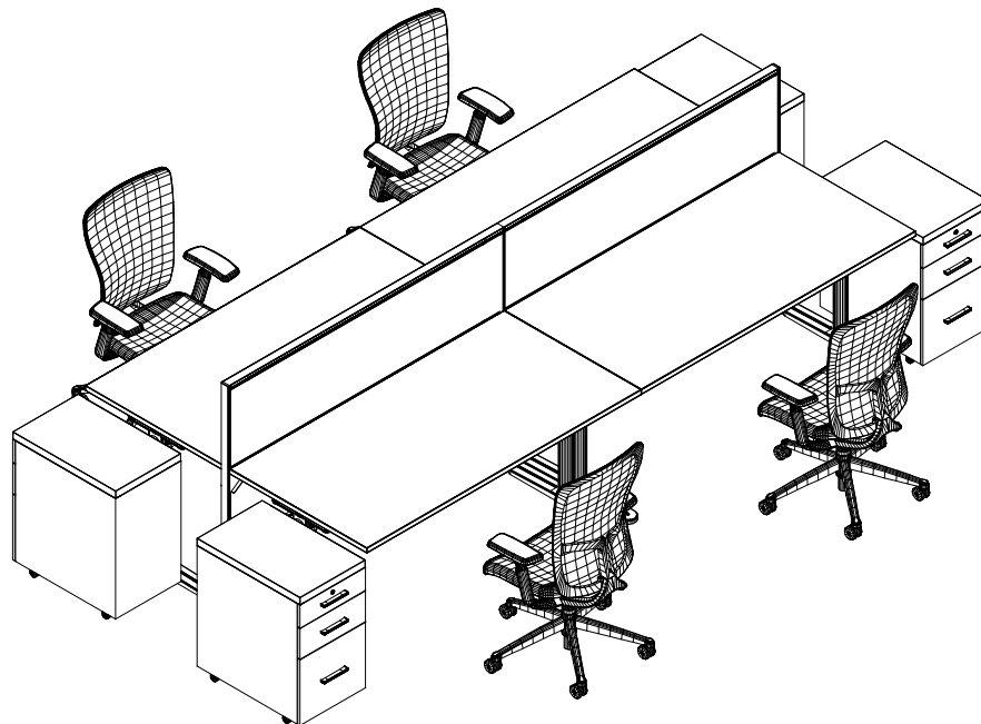
3D Isometric not to scale