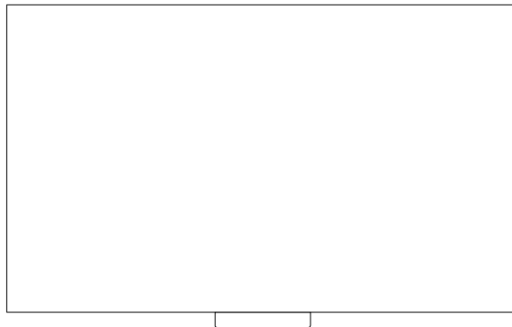
Plan View scale 1 : 10 mm